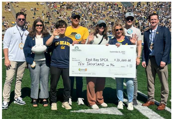
Central team at Cal Bears football game presenting a generous $10,000 donation to East Bay SPCA. Thank you, Central.