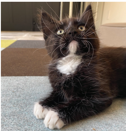
"Foster Win" Miles Davis