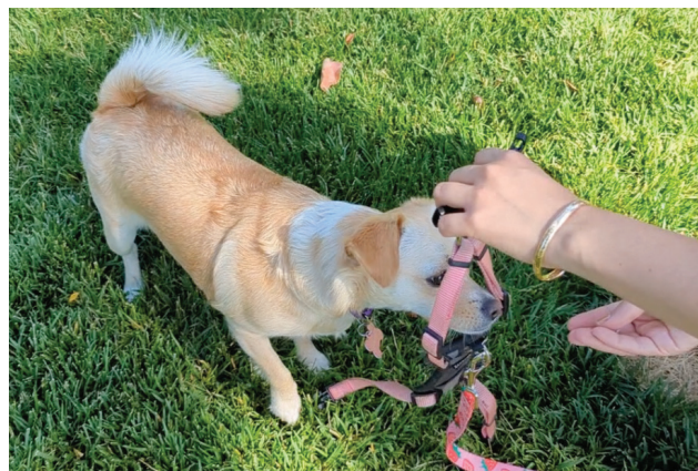
Getting comfortable with a harness

Our training programs aren't just tailored to dogs. We are proud to be one of the few places that provides private training and webinars to address behavior issues with cats.