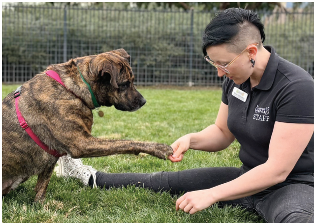
Learning a new trick

East Bay SPCA brings the innovative care we provide for shelter animals to the pets in our community. Through our range of Behavior & Training programs and resources, we provide affordable and accessible expertise to meet the needs of pets and their people. Our training programs are rooted in our progressive behavior philosophy. Through positive reinforcement-based training, we're not only following the latest science for effective training methods, but we also strengthen the relationship between pets and their families.