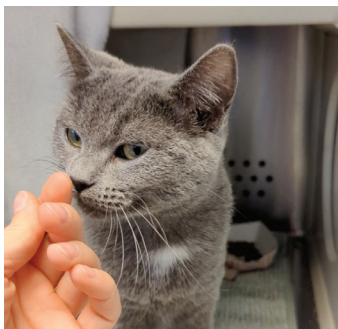
Hisses to Kisses

Our Hisses to Kisses webinar is an innovative program designed to address fear in cats and boost their confidence. It's based on the approach we use to help the cats in our shelter and can be applied to cats in homes.