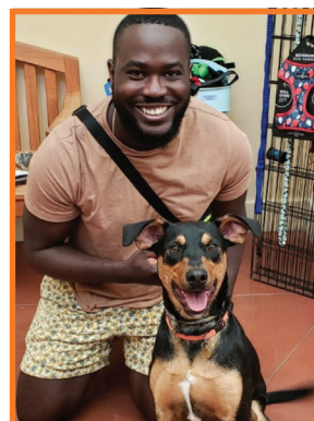
Buddy, adopted May 2023

cat and a dog at home, so Julius had “big shoes” to fill. He gets along well with both of my four-legged babies. He is confident, personable, and very loving. I’m very lucky!