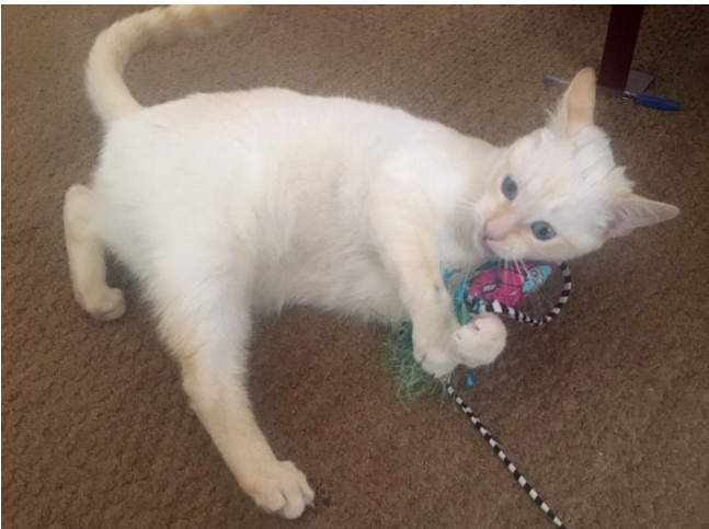
Coconut playing in his forever home

"We are so in love with our little Coconut. We had to come back for him," she says. "Thank you for giving him a second chance. He is the best cat and we are so happy we found him!"