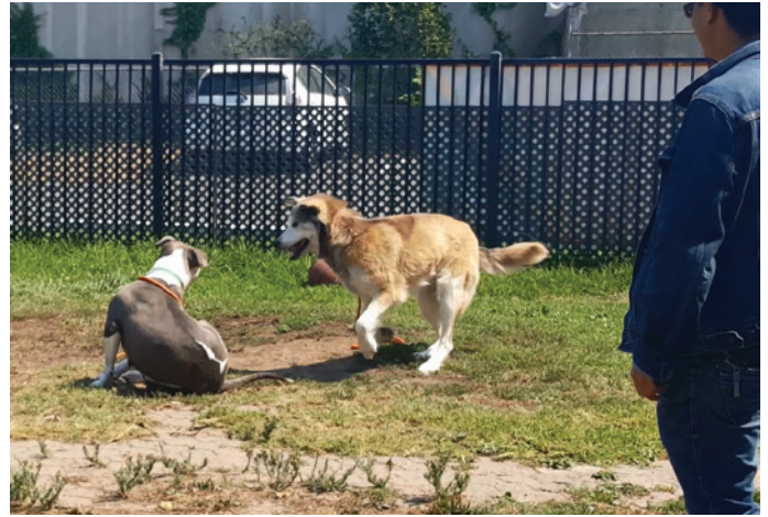
Viggo meeting shelter dog, Bubbles