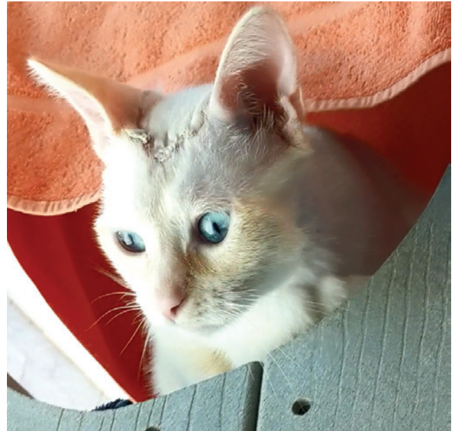
Coconut recovering after surgery.

So far this year, 869 animals have been fostered in Oakland and Dublin*