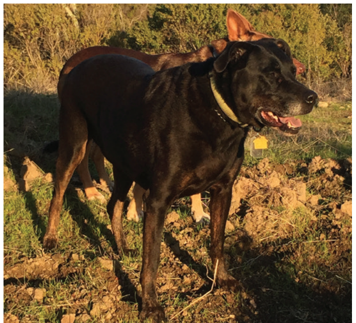
Kash (formerly known as Jethro), Carr Fire rescue