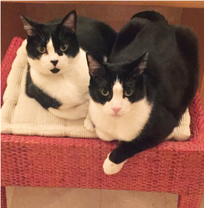
Kip and Flip, bonded pair

Here are some of the happy senior pets that were recently adopted from our Oakland and Dublin Adoption Centers! Do you have a Happy Tails story and photos to share? Submit them at eastbayspca.org/happytails .