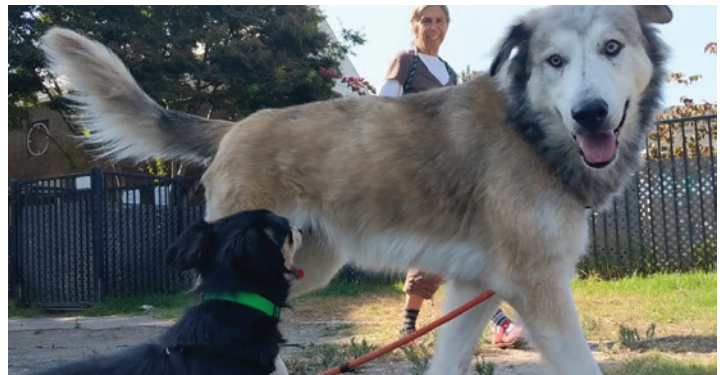
Meeting other dogs at the shelter helped build Viggo's confidence